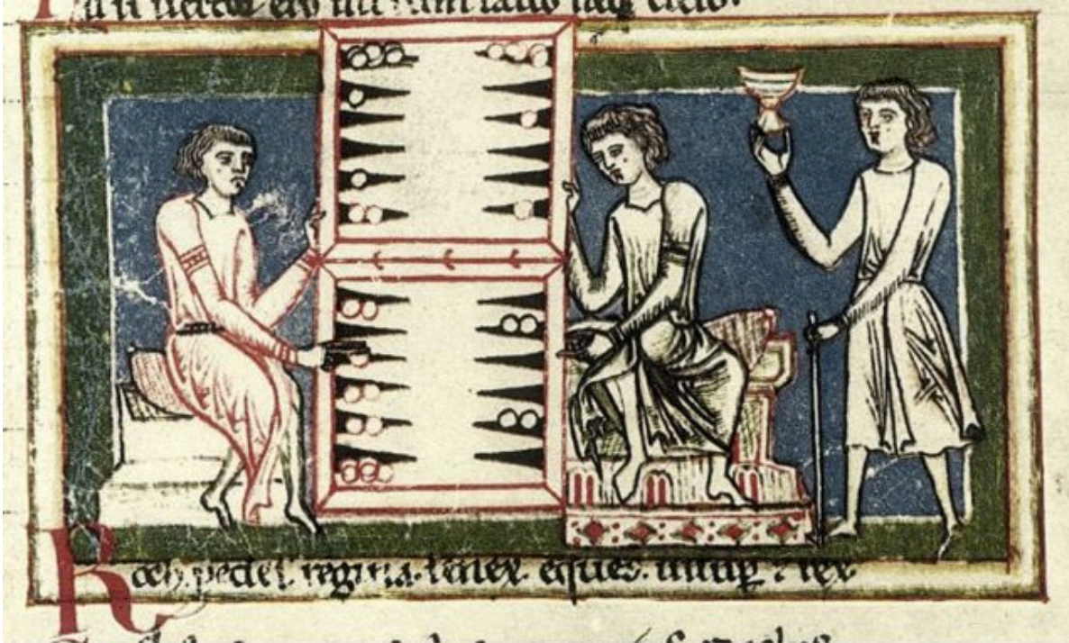
Tables players, from the Carmina Burana

“Ludas Duodecim Scriptorum”, a Roman game, is thought to descend from Senet. It’s played on a board of 3 x 12 rows of points. The game was altered around the 1st century AD, and it lost a row of points. It continued to evolve, and by the 6th century it was known as “Alea”. Emperor Claudius was said to have enjoyed this game so much that he had a board built into his carriage.