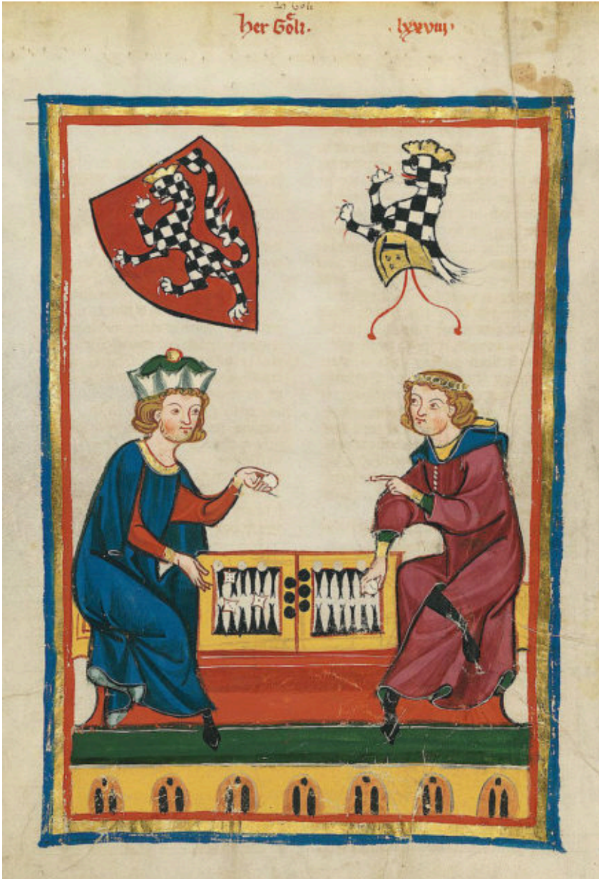
Herr Goeli, from the 14th century Codex Manesse

The points are numbered from low to high on each of the player's home boards. There are set places where playing pieces start, and the pieces are moved according to the roll of the dice. To win the game, you need to successfully move all your pieces onto the home board before your opponent does. There are many sites and books you can refer to that will help you learn how to play.