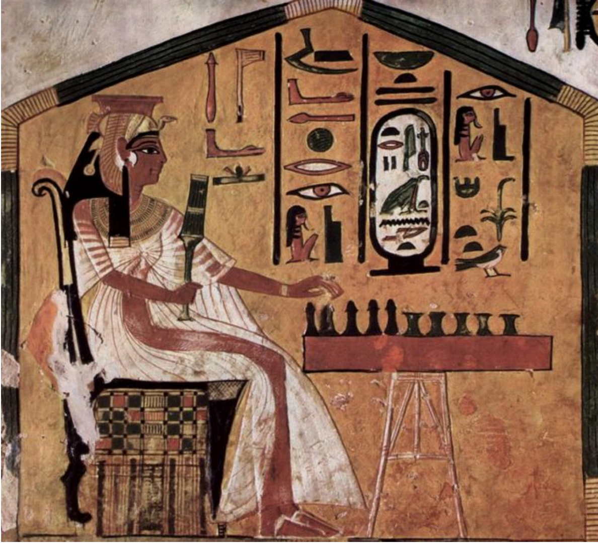
Senet, one of the oldest known board games

The oldest version of backgammon that archaeologists have uncovered so far is from the Iranian city of Shar-e Sukhteh; its board and markers have been dated to 3,000 BC. The board is rectangular and made of ebony – illustrated with an engraving of a snake. The serpent is coiled around itself twenty times, and this creates 20 slots for the game (today’s version has 24). Markers found with the game were made from turquoise and agate, and sixty of them were discovered along with the dice. Wooden boards have been found in the royal tomb of the “Ur al Chaldees” in the center of Sumer, but these were dated to only 2600 BC and are known as “The Royal Games of Ur”.