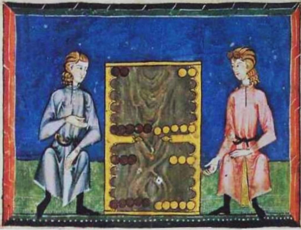
All tables from the Book of Games

In 1743, Edmund Hoyle, who wrote “proper” rules for many board and playing card games, published the first official rules for backgammon. Over the years the game has waxed and waned in popularity.